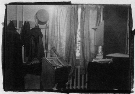
Synagogue Bema (Stage) Mukachevo Synagogue, Ukraine 2007