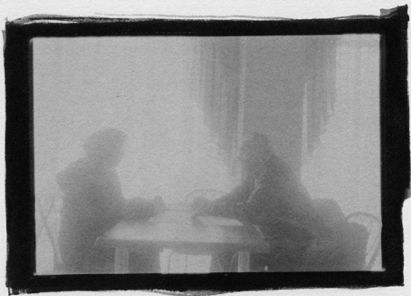
Meeting, Soup Kitchen Ushzgorod, Ukraine 2006