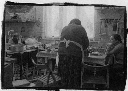
Soup Kitchen Mukachevo, Ukraine 2007