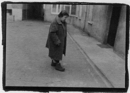
14 Targowa Street, Kantor Family Residence Pre-WWII Czestochowa, Poland 2006